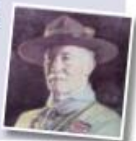
DIAMENDA CO RECTO DESPRESA